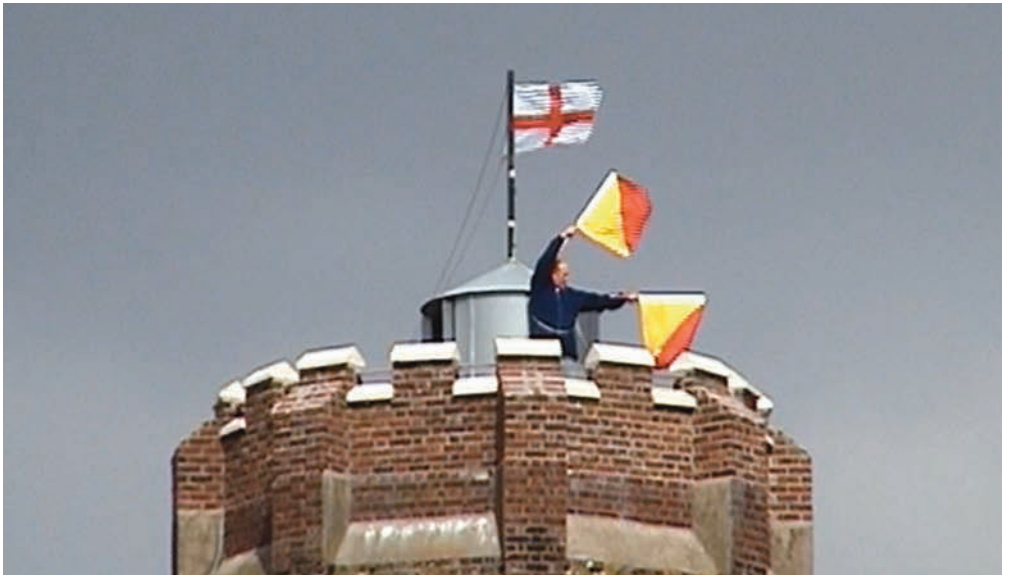
Bettina Furnée Exhibition & Site Specific Artworks